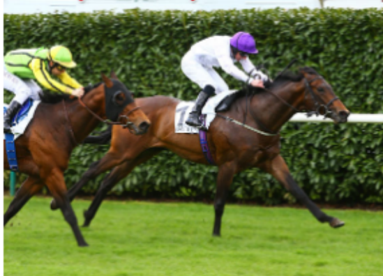
Sands Of Mali